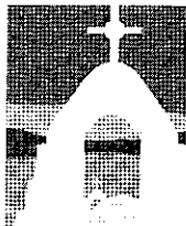
Room at the Inn

For additional information, to volunteer or make a donation, please contact us at: